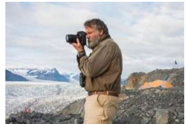
CU-Boulder Professor Tad Pfeffer, shown here on Alaska’s Columbia Glacier, is part of a team that has mapped nearly 200,000 individual glaciers around the world as part of an effort to track ongoing contributions to global sea rise as the planet heats up.

http://www.colorado.edu/news/releases/2014/05/06/international-team-maps-nearly-200000-glaciers-quest-sea-level-rise